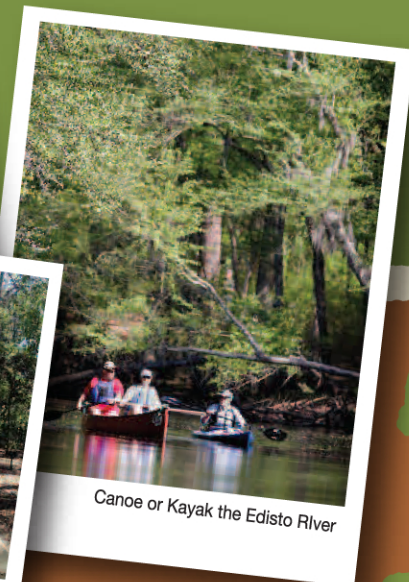
Canoe or Kayak the Edisto River